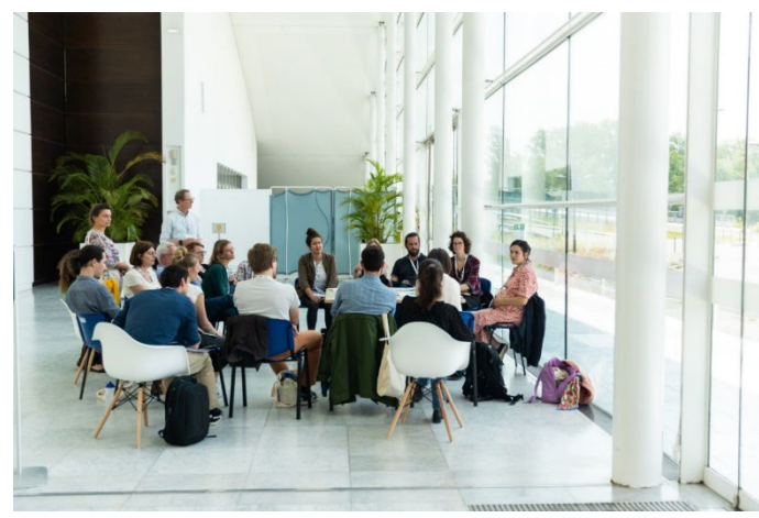
Illustration of a Challenge workshop 2023 edition in Bordeaux