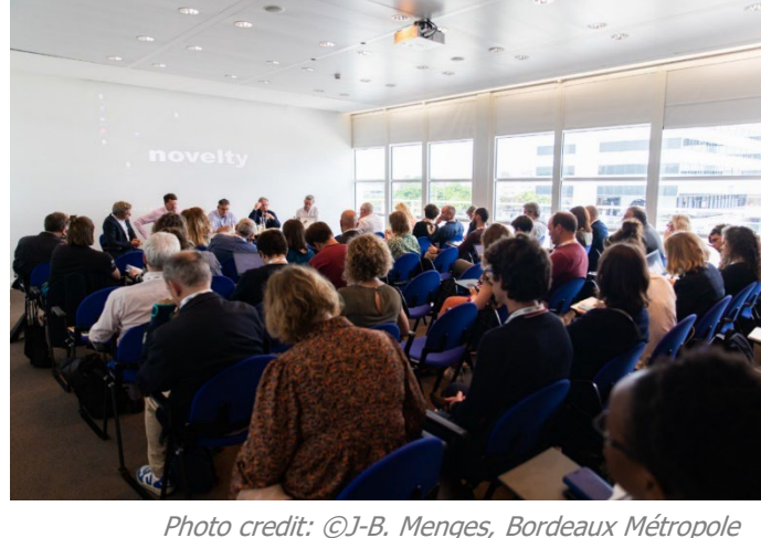
Illustration of a Challenge workshop