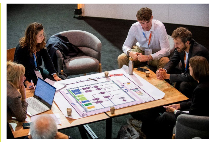
Illustration of a Challenge workshop Edition 2024 in Dunkirk

If you want to raise awareness of a subject in a fun way, this workshop is for you! Board games, role-playing, quizzes, storytelling, theatre, one-man shows... give your imagination free rein and surprise delegates with some serious games.