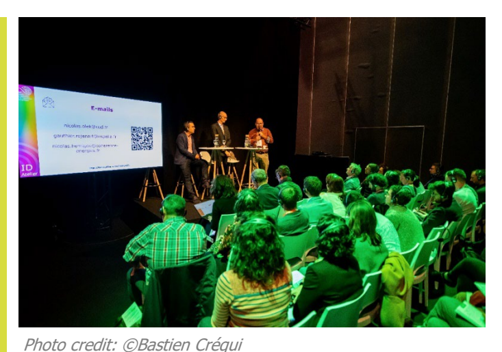
Illustration of a Challenge workshop

Projects, initiatives, technologies, etc. We give the floor to those who are driving forward the energy transition.