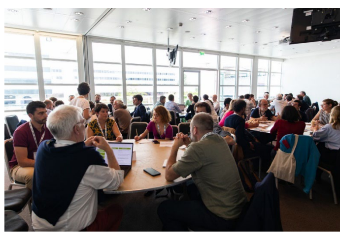
Illustration of a Challenge workshop 2023 edition in Bordeaux