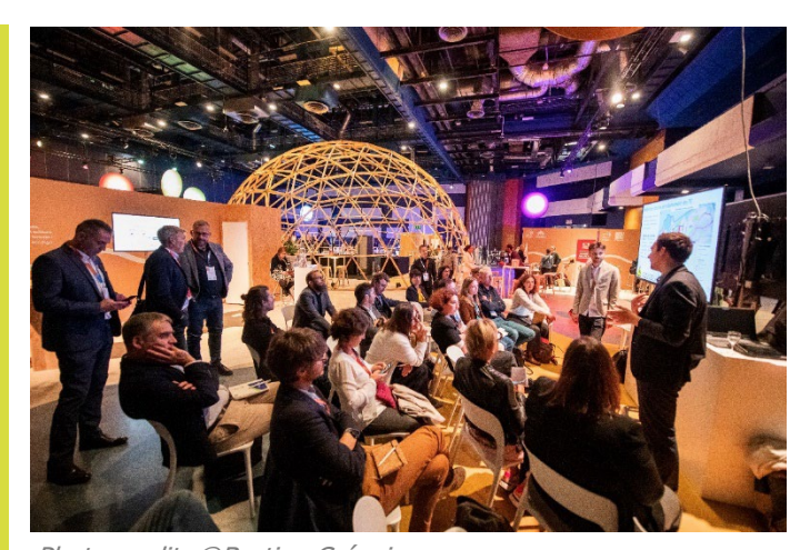
Illustration of a Challenge workshop

Invite delegates to work together to develop possible courses of action in response to a question you have.