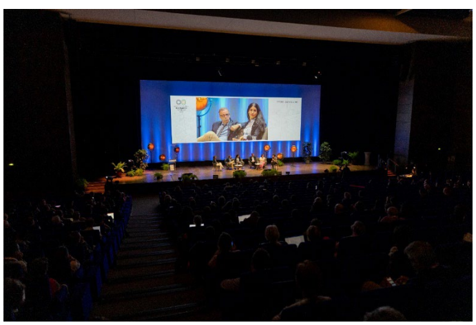
Illustrations from the 24ème European Energy Transition Conference in Bordeaux